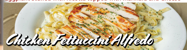
Chicken Fettuccini Alfredo